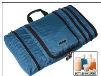
Maximize your luggage space with a flat toiletry bag.

works particularly well with packing cubes and envelopes. For example, the eBags Pack-it-Flat Toiletry Kit ( ebags.com/product/ebags/pack-it-flat-toiletry-kit/54638 ) provides a very space-efficient way to keep you looking your best on the road.