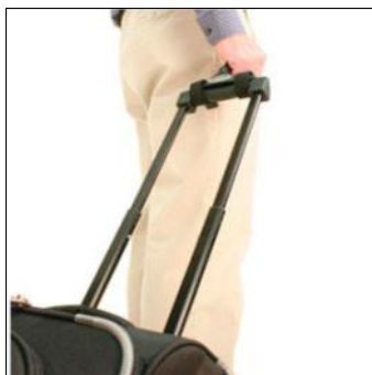
A luggage handle extender by Travelon can help you avoid an aching back.

Unless your bag is neon-pink or has a leopard print, consider attaching a brightly colored luggage tag so you'll be able to quickly identify it at the baggage carousel. If your wheeled carryon bag forces you to hunch over because the handle is too short, try a luggage handle extender from Travelon ( travelonobags.com ).