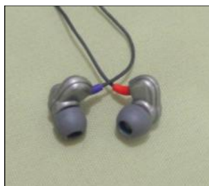
Noise-isolation headphones block most external sounds.

a physical barrier between your eardrums and the environment. They basically act like earplugs with embedded headphones. Some people find in-ear headphones like this to be uncomfortable to wear for long stretches. The best models provide a selection of silicone and compressible foam tips so you can find the type which works best for your ears. Popular brands of noise-isolation headphones include Etymotic Research, Shure, Ultimate Ears and Westone.