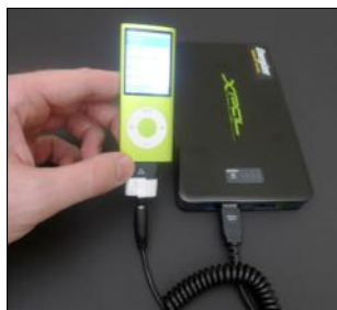
This Energizer external battery pack (in background at right) can extend the run time of your device by many hours.

A cross-country or transatlantic flight may be too much for your portable DVD player or laptop computer's battery. Avoid entertainment interruptions by packing a rechargeable external battery pack . After all, you don't want to run out of juice halfway through Avatar , right? Depending on capacity, these external packs can extend the battery life of a device by several times. Most batteries offer multiple tip sizes to ensure maximum compatibility with the gadgets you own.