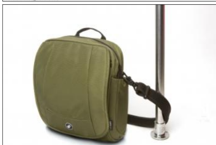
Pacsafe bags incorporate numerous security features.