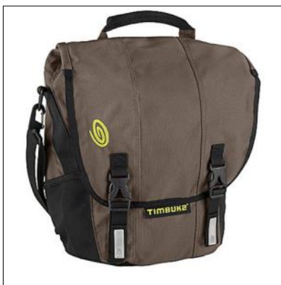
A top handle can make it easier to grab your bag in a hurry.