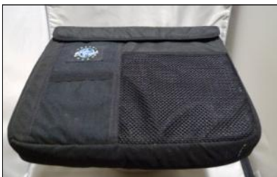
A padded laptop sleeve can convert an ordinary bag into a computer bag.