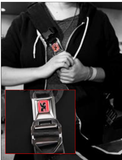
Chrome messenger bags feature a unique strap-release system.

come with cushioned pads, which are great for a heavy load. If your ideal bag lacks a cushioned pad, you can easily add one ($10-$20). Chrome bags integrate a seat-buckle into the strap. You simply press the release button, which parts the strap and allows the bag to drop to the floor. This lets you avoid lifting the strap of a heavy bag over your head.