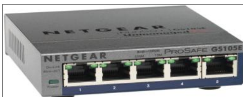
A network switch, such as this model from Netgear, lets you attach additional devices to your network.